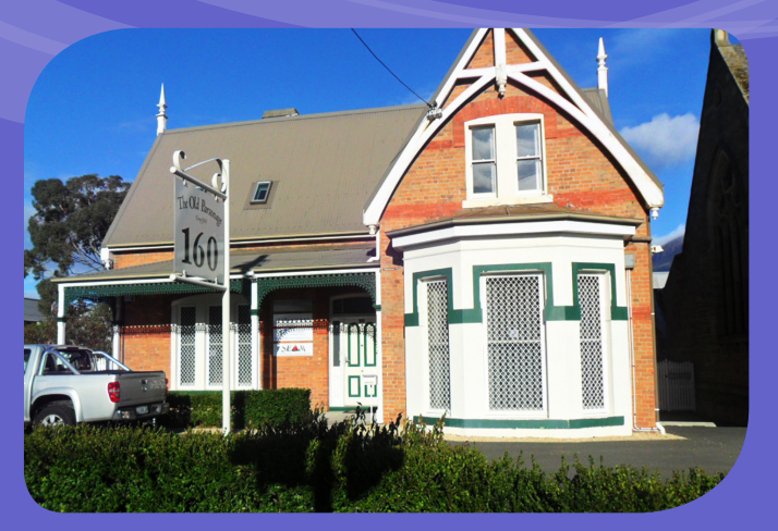
The Old Parsonage, 160 New Town Road, New Town